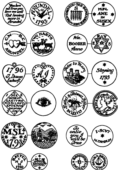
Collection of eighteenth-century Sussex love-tokens, charms, or witch-scarers (reduced).